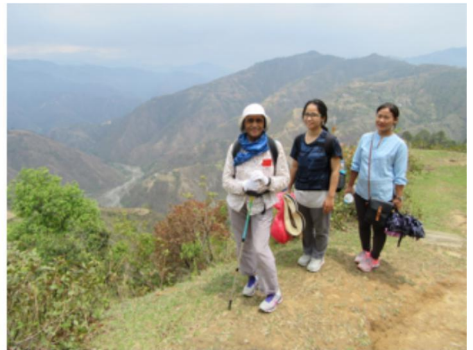
Up and down to Kalika School....