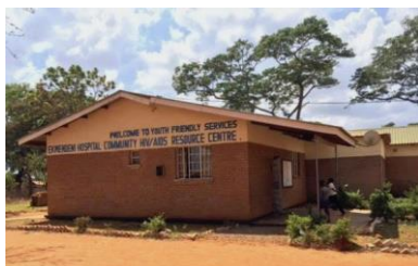
The Resource Centre