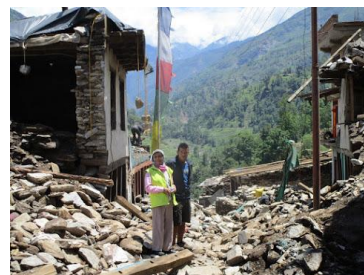
The 2015 earthquake