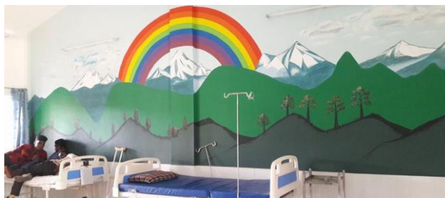
In the new Children's unit