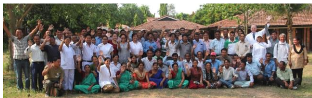
The staff of Lalgadh Leprosy Trust