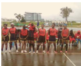
Girls' champion netball team (it can be wet in Malawi!)