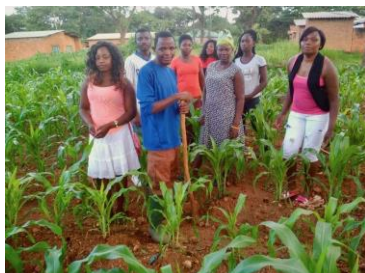
Young people tending a garden