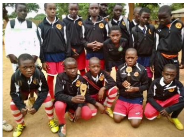
Junior footballers on a sunnier day